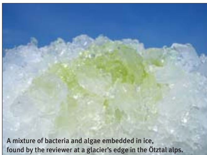
A mixture of bacteria and algae embedded in ice, found by the reviewer at a glacier's edge in the Ötztal alps.